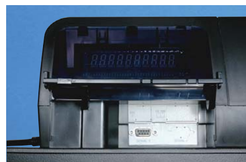
One Standard RS-232C Port Hidden Behind a Convenient, Easy to Access Door