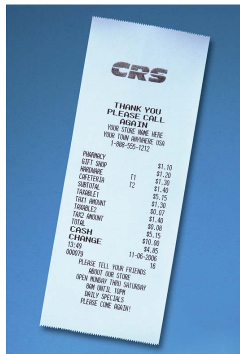
Thermal Receipt Shown 60% Actual Size