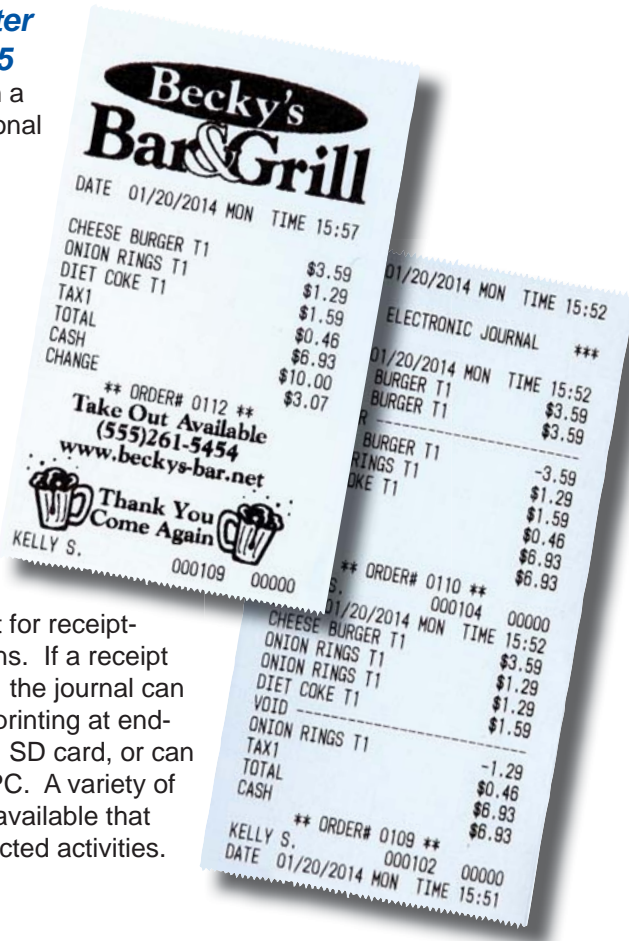
Receipt Featuring Graphic Logo and Message Shown 75% Actual Size

Single printer models are best for receipt-only or journal-only applications. If a receipt and a sales journal is needed, the journal can be archived electronically for printing at end-of-day, can be collected on an SD card, or can be polled and collected by a PC. A variety of electronic journal reports are available that allow you to quickly audit selected activities.