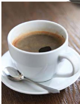
Bars / Ice Cream Parlors / Coffee Shops