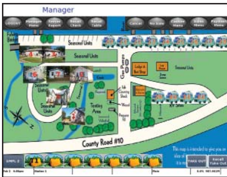
Customized graphical table maps.