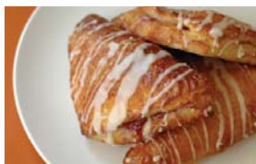
Dusty Environments Like Pizza and Bakeries