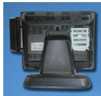
Tool-Free Access to Compact Flash or Hard Disk Drive Optimizes Serviceability