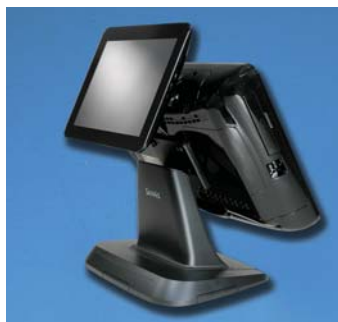
Optional Integrated 9.7" or 7" Rear LCD Customer Displays (Reflection for Windows)