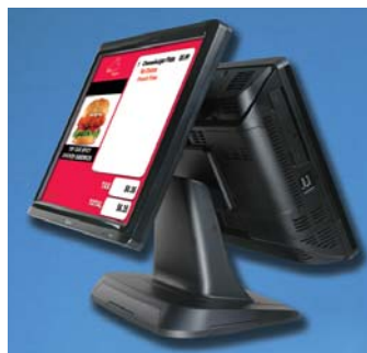
Optional Integrated 15" Rear LCD Customer Display (Reflection for Windows)