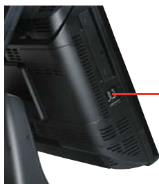
Two USB Ports on the Left Side