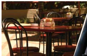
Food Concessions / Fast Casual Restaurants