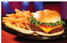
Cafeterias / Table Service / Quick Service